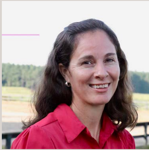
B.S., University of Florida Ph.D., University of Florida