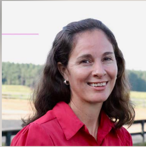
B.S., University of Florida Ph.D., University of Florida